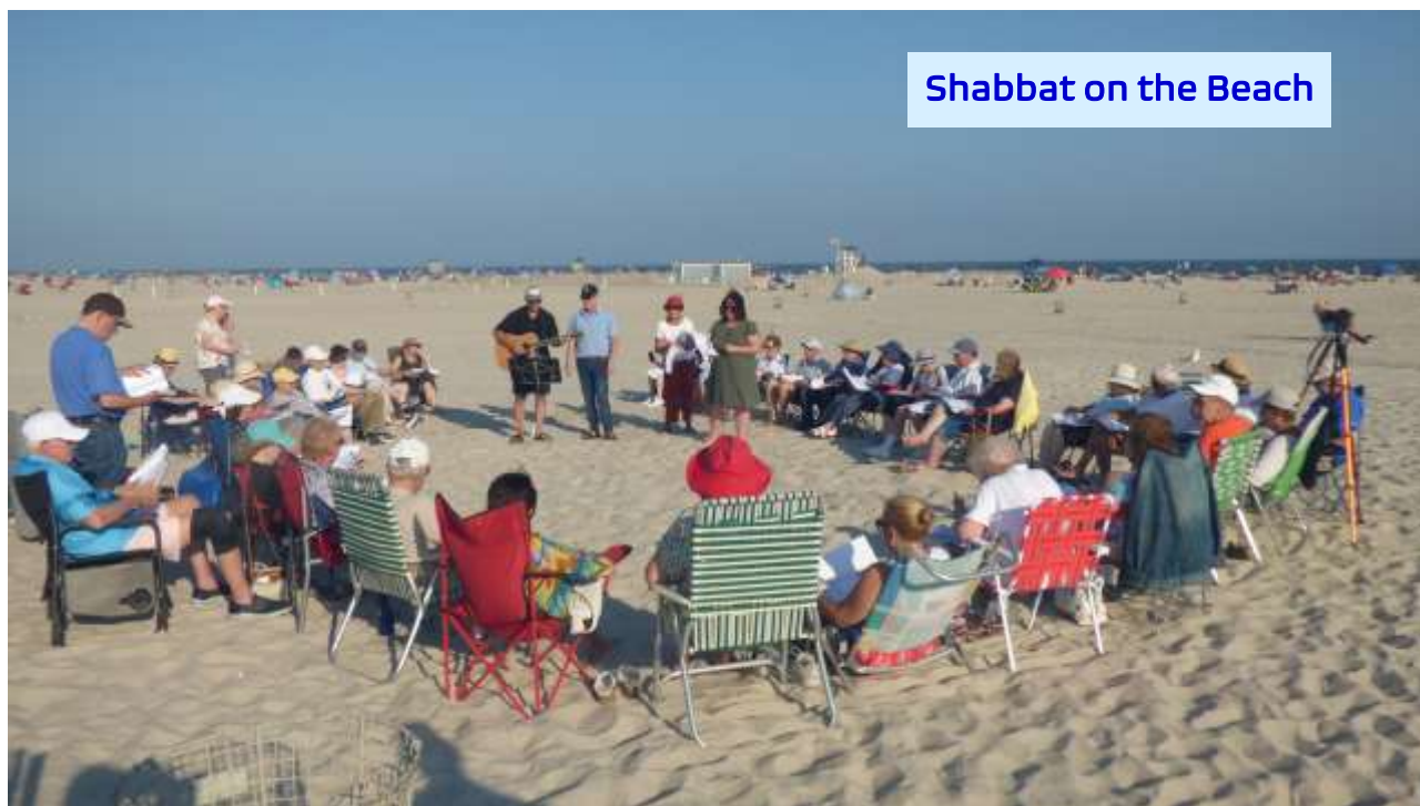
Shabbat on the Beach

Since it is on the second day of Shemini Atzeret that the annual cycle of the weekly Torah reading is completed, that day has also become known as Simchat Torah, or Rejoicing of the Torah.