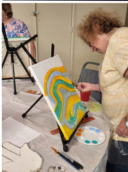
Sisterhood Hamsa Paint Night